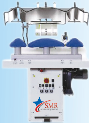
Coller & Cuff Press