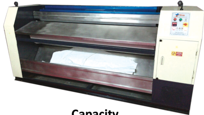
Capacity ER 2000, 3000